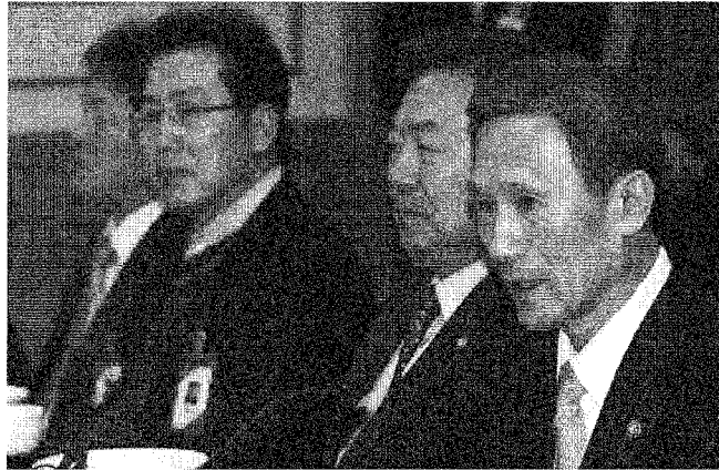
Defense Minister Kim Kwan-jin gives a briefing on North Korea's recent jamming of communications signals in South Korea during a meeting with lawmakers at the National Assembly on Wednesday.

“As I mentioned many times before, the modern-day warfare is electronic warfare. Success in a modern war depends on how we carry out the electronic warfare operations,” he said in the manual.