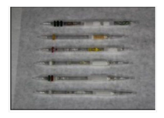
[Gas mask and gas indicator ampules seized by Greek authorities in November 2009. Image Credit: 2012 UN POE report (S/2012/422), Figure XI, page 29.]

Because neither shipment contained protective boots, the POE inferred that "one or several other shipments may have escaped seizure." Both shipments originated in the North Korean port of Nampo, were trans-shipped through China, and were on their way to Latakia, Syria. In April 2013, Turkish authorities found a third shipment, <sup>366</sup> containing North Korean-made gas masks, aboard the M/V El Entisar. <sup>367</sup>