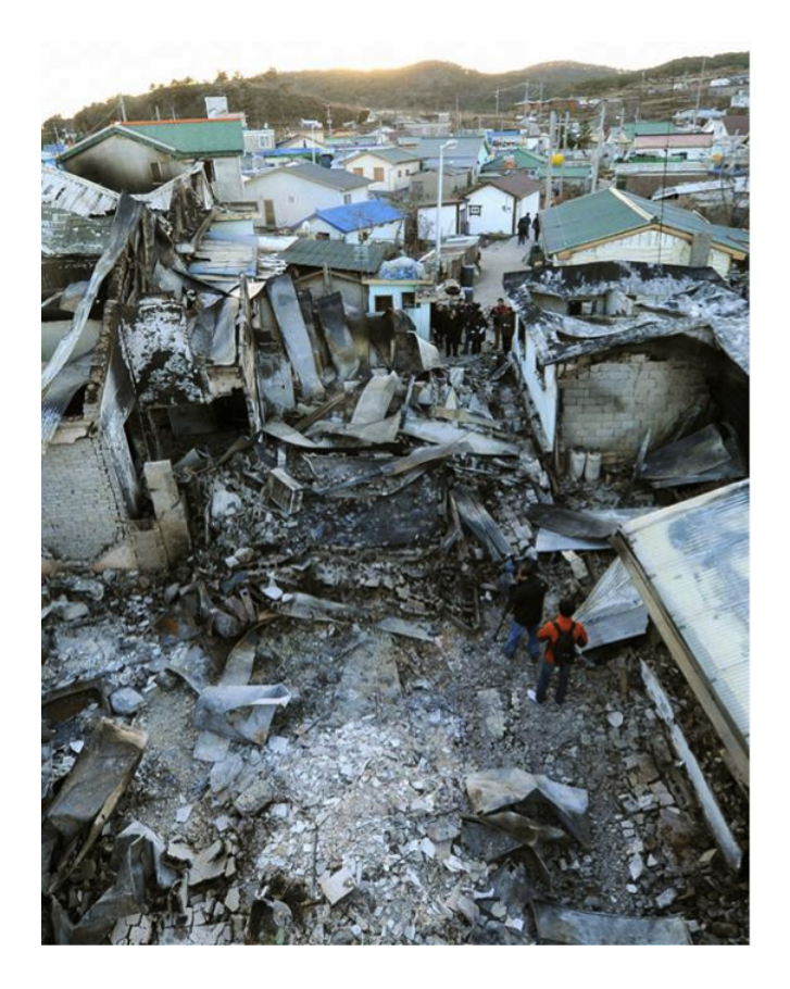
[Destroyed civilian homes on Yeonpyeong Island. Image Credit: Kyodo/Reuters<sup>379</sup>]

On November 24, 2010, North Korea shelled the island of Yeonpyeong, including the civilian village located on the island. The attack killed two South Korean civilians, and two Republic of Korea Marines.<sup>377</sup> Yeonpyeong Island is one of several South Korean islands in the Yellow Sea that lie within waters claimed by both North and South Korea. North Korea said that the attack was in response to South Korean live-fire exercises in waters it claimed.<sup>378</sup>