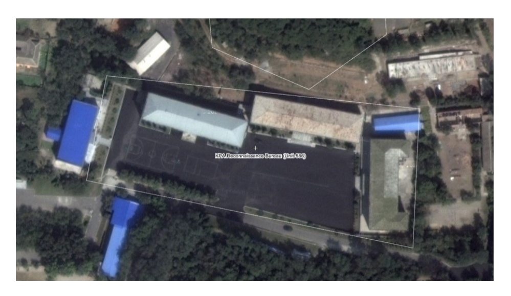
[Satellite image of RGB facility north of Pyongyang, via NKEconWatch.com<sup>111</sup>]

Thus, the RGB's role in North Korea's foreign clandestine operations is analogous to that of Iran's Quds Force.