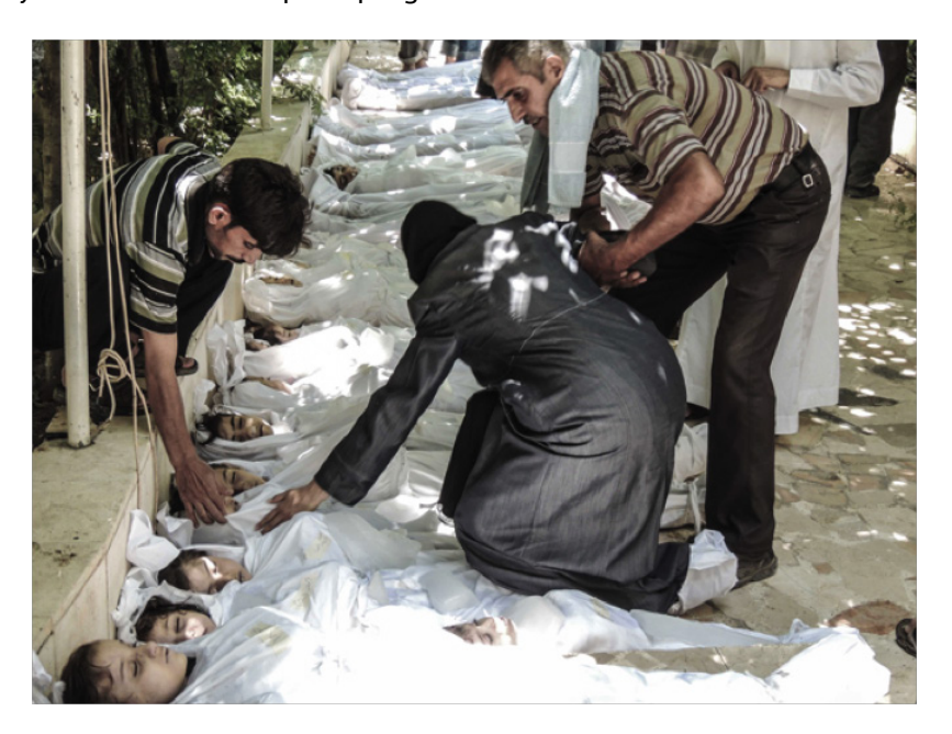
[Syrian children, allegedly killed by a regime chemical weapons attack.<sup>371</sup>]

President Obama has accused the Syrian government of using chemical weapons in the civil war that broke out in 2011. A Pentagon spokesman has credited the possibility of North Korean assistance to Syria's chemical weapons program.<sup>370</sup>